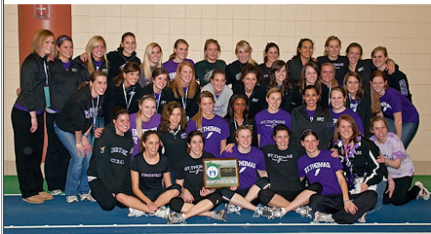
2010 MIAC Women's Champions - University of St. Thomas

In the men's competition, St. Thomas edged Hamline by seven points, 163 to 156, to claim their 26th MIAC Men's Indoor Title in the 26 years the championship has been held. Bethel finished in third with 121.5 points, Gustavus was fourth with 79.5 points, and St. Olaf placed fifth with 71 points.