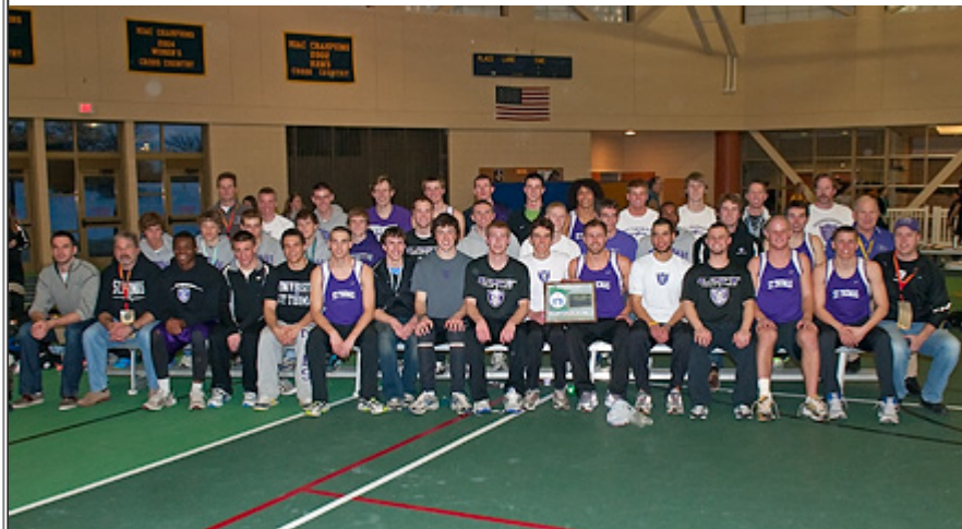
2010 MIAC Men's Champions - University of St. Thomas

Top men's performances from Saturday included: